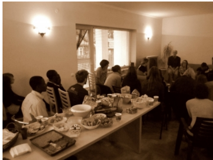
Church Dinner & Vision Meeting