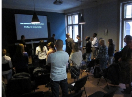
Worship Sunday Morning

"Being confident of this very thing, that He who has begun a good work in you will complete it until the day of Jesus Christ."